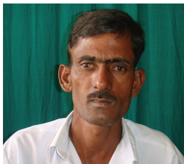
[Table/Fig-6]: Final prosthesis in situ

extensive research into various aspects of ocular prosthesis fabrication. Navy investigators concluded that each enucleated eye socket was individual in nature. Hence, it is critical to make an accurate impression of the site to be restored. Criteria for an acceptable impression included accurately recording the posterior wall, the position of the palpebrae in relation to the posterior wall, and the greatest extent of the superior and inferior fornices of the palpebrae.