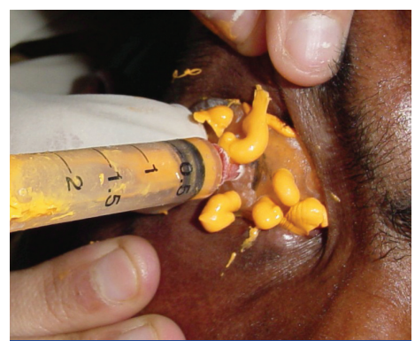
[Table/Fig-3]: Impression of the defective eye