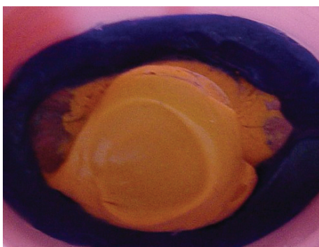
[Table/Fig-4]: Beading and boxing of the final impression