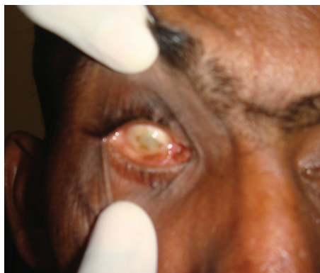
[Table/Fig-2]: Defective right eye